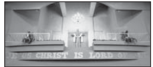
Immanuel’s Church Sanctuary