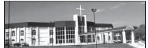
Immanuel’s Church Worship Center